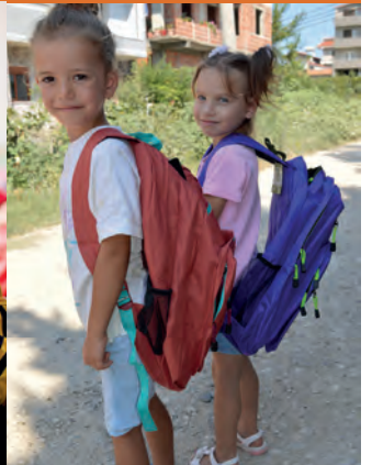
OPERATION CHRISTMAS LOVE