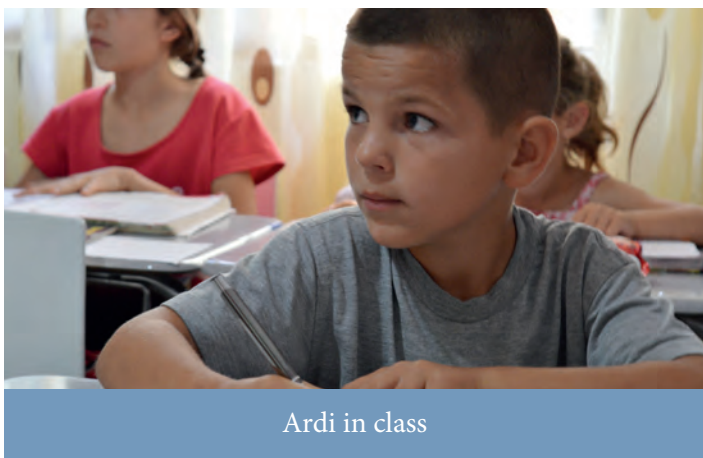
Ardi in class